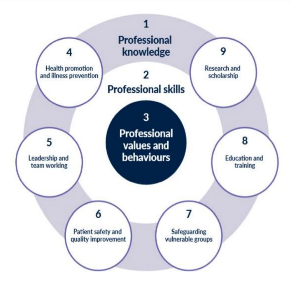
Figure 1: Domains of the generic professional capabilities framework

The overall outcome of training in this credential is to provide the competencies required to recognise, stabilise and manage an acutely unwell patient, for up to 24 hours if evacuation is necessary, as well as the management of appropriate inpatient cases. Those following the credential are expected to achieve the knowledge, skills and behaviours required to: