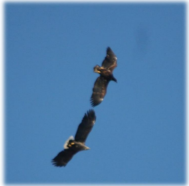
SEA EAGLE AND GOLDEN EAGLE