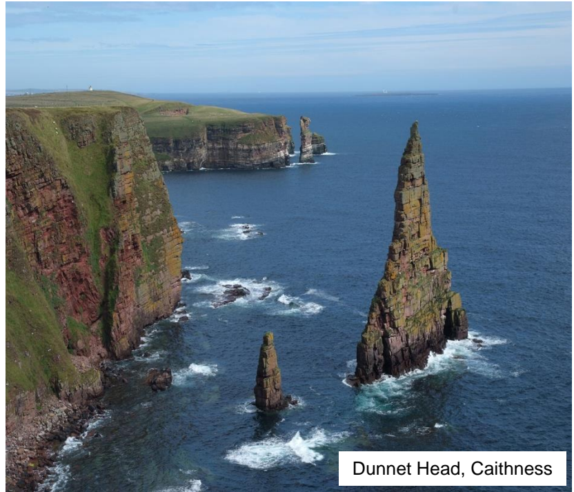
Dunnet Head, Caithness

This is big country, with wide skies and dramatic seascapes, and rolling moors merging westwards into rugged peaks in North Sutherland. Wick and Thurso are the two main centres, both with a good selection of shops (including Tesco) and other amenities. The coast between Wick and Thurso is spectacular and includes, near John O'Groats, the Duncansby Stacks, as well as Dunnet Head (with amazing views of Orkney). Castle of Mey, the home of the late Queen Mother is also near by. Inland the dominating feature is the Flow Country, with miles of interlaced pools and lochs. There is also a wide range of attractions with heritage and archaeological interest. You can golf on Britain's most northerly mainland course, while angling, wildlife cruises and other wildlife activities are on offer.