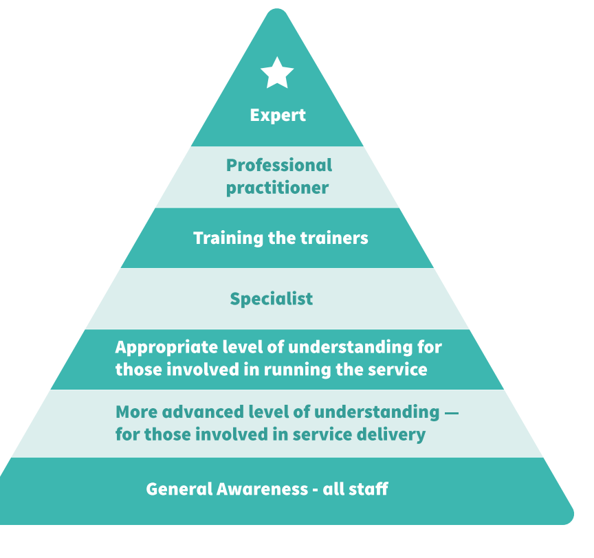
Figure 2. A proposed structure for supporting the embedding of Human Factors and Ergonomics principles in health and social care education and practice

A key part of the SKIRC role is co-leading national development work on embedding Human Factors principles in healthcare education and practice. Based on related research, a number of educational and research outputs are helping to building Human Factors capacity and capability nationally in pharmacy undergraduate education, required competencies for healthcare professionals and others (Figure 2), and particularly in implementing concepts and methods in patient safety and quality improvement training, interventions and everyday practices.